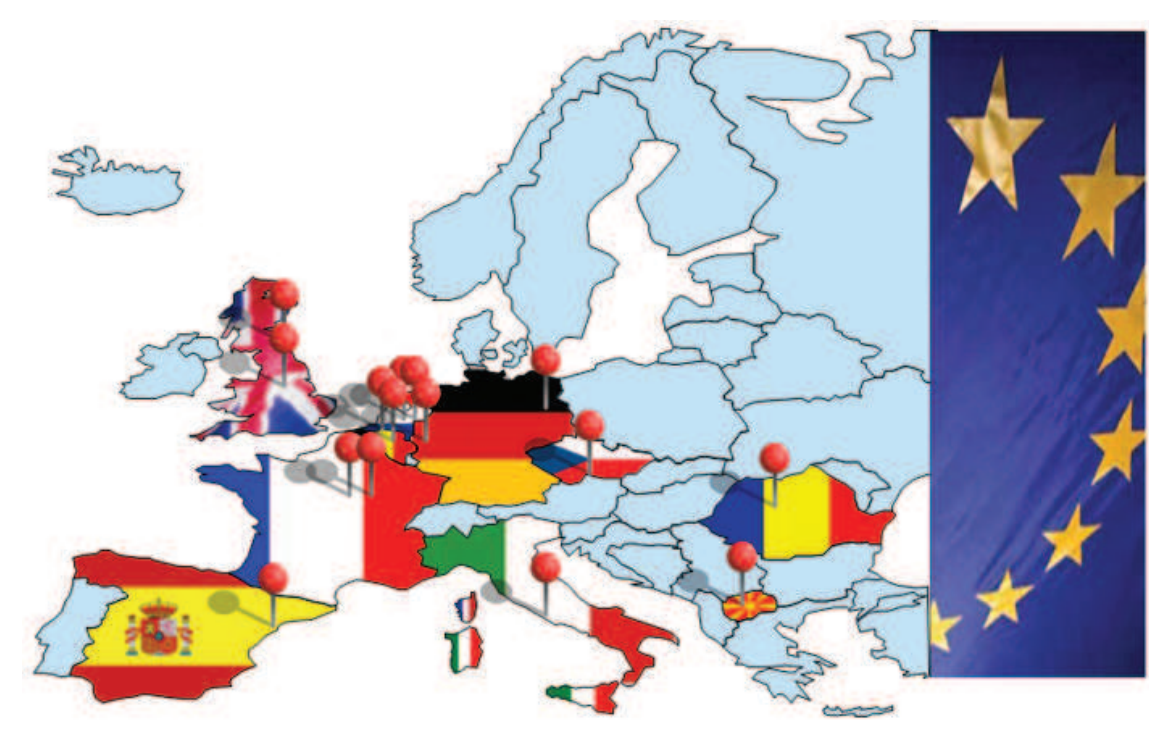
Figure 1: Map of Europe with countries involved in COMPOSITE

in Europe's police forces with the aim to identify critical success factors of change processes. COMPOSITE is supported by the European Commission as part of the 7th Framework Programme for Research and Technological